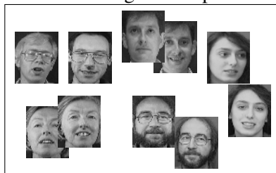
linked 2d image scatterplot